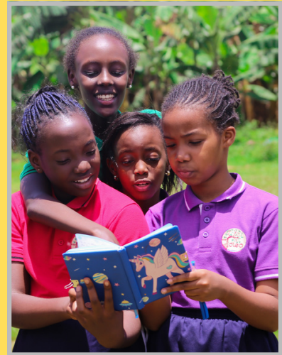
Pupils participating in Book Week

We reach out to children through training in creative writing, poetry, dance and theatre.