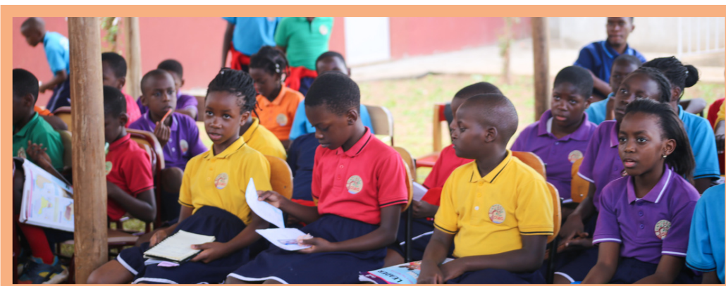
Preparing for the Babishai creative writing class